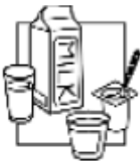
Milk, Yoghurt and Cream