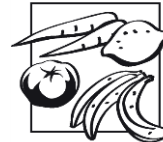
Fruit, vegetable and frozen product