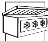
Freezer (subject to individual trials)